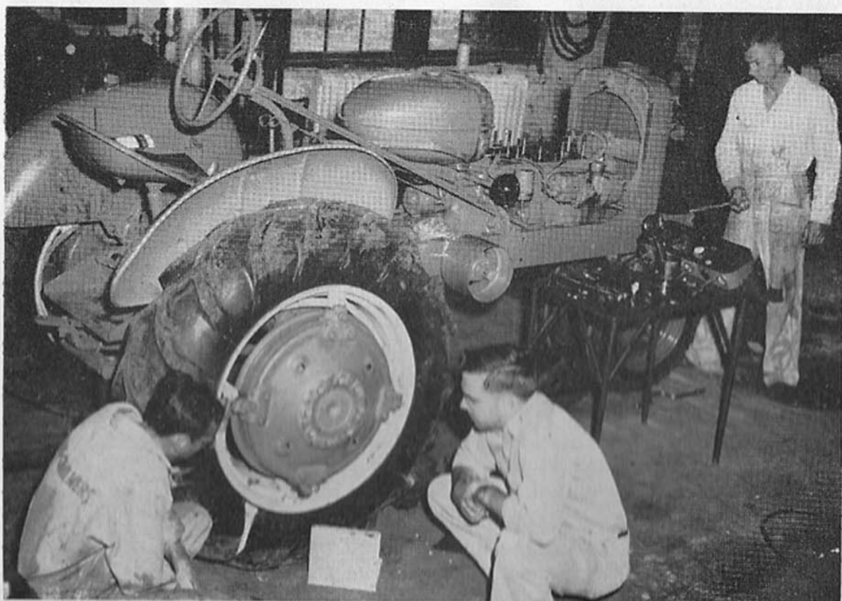
Checking gear ratio (Test No. 399).

At ten-minute intervals readings are taken or observations made of engine belt pulley and brake speed, load on scale beam of dynamometer, temperature of water in top tank of radiator, air temperature at a point approximately five feet in front of the center of the radiator, and amount in pounds of fuel used. Barometer readings are taken every hour. The water level in the radiator is measured at the beginning and at the end of the two-hour period, and the necessary amount of water is added to raise it to the same level as at the start of the two-hour test. Water, if used in the fuel mixture, is checked in the same manner.