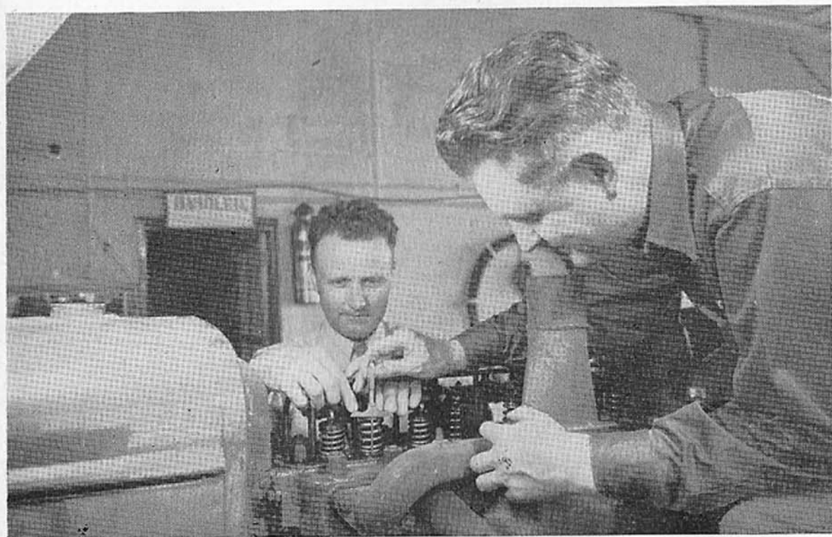
The valve lift is measured to check manufacturer's specifications.

At this time the tractor is inspected. The manufacturer's representative, when so directed by the engineer in charge, disassembles any part of the tractor or its accessories in order to facilitate inspection. Particular attention is centered on such specifications as clearance volume, valve and port dimensions, bore and stroke, transmission, differential and belt-pulley reduction ratios, and the conditions of such parts as valve heads and seats, spark plugs, magneto or distributor breaker points and fuel, oil, and water connections.