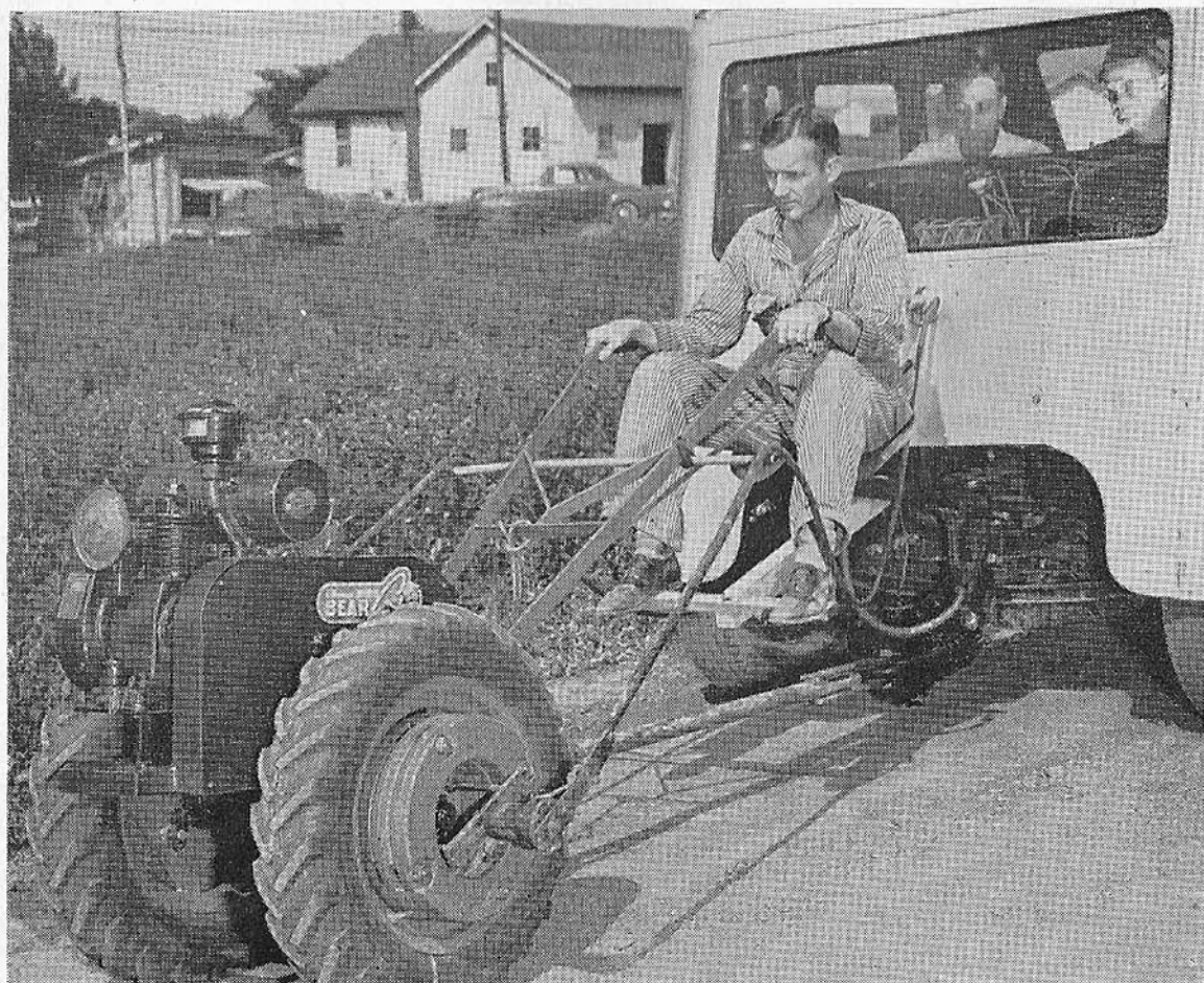
One of the small tractors tested in recent years (Test No. 379).

Another loading machine built about a pneumatic-tired 15-30 McCormick-Deering tractor was first used in the 1936 testing season. The rear wheel equipment was changed to dual zero-pressure tires for the 1937 and 1938 seasons and back again to more heavily weighted pneumatic tires for the 1939, 1940 and 1941 seasons. A four-speed transmission mounted in the power line from the tractor rear wheels to the gear-type pump permits the use of this machine at travel speeds up to approximately 25 miles per hour. Still another machine, a smaller one, has a range of load from about 200 pounds to 1,600 pounds and a possible top speed of 40 miles per hour. The essential parts of this machine are the rear axle assembly and transmission from a heavy-type passenger car, a gear-type pump, a radiator and fan, a supply tank, and suitable controls. Three Cletracs, two large and one medium sized, together with two additional rubber-tired McCormick-Deerings, a 15-30 and an I-20, are used as supplementary loading units when the occasion demands.