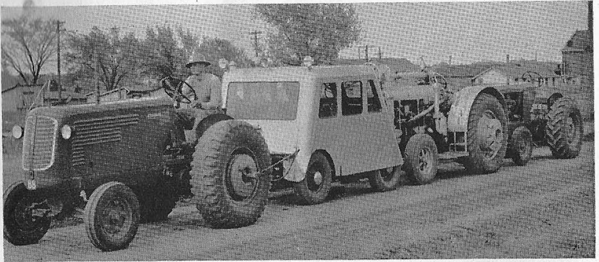
Ten-hour drawbar test (Test No. 391).

Test A. —The first run is made on the drawbar and is known as the "limber-up" run. The principal object of this test is to take out the stiffness likely to be found in a new machine and give an opportunity to check the condition of the tractor and ascertain if all the parts are working normally. The tractor is operated at approximately one-third rated load for four hours, two-thirds rated load for four hours, and full rated load for four hours. A reasonable amount of additional time is granted if desired. Each one of the forward gears is used for some portion of this test. The manufacturer's representative is responsible for the operation of the tractor during this test and may make such adjustments as he believes necessary, provided they do not conflict with the specifications in the application for test.